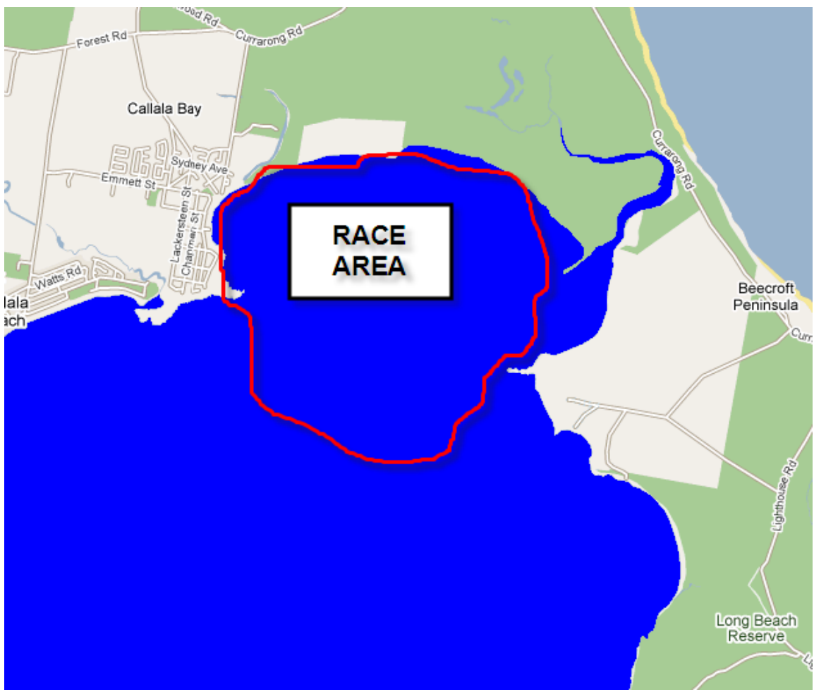
Page 8 of 8, JBSC Ocotber NOR – V1 14/6/17